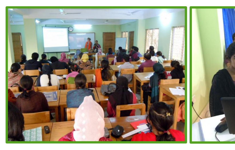
Figure 2. Introducing the e-library. January 2013.

"Accessing HINARI is always a good experience to find what I'm looking for, every moment for writing dissertation and research." 4<sup>th</sup> year BScPT student